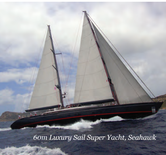
60m Luxury Sail Super Yacht, Seahawk